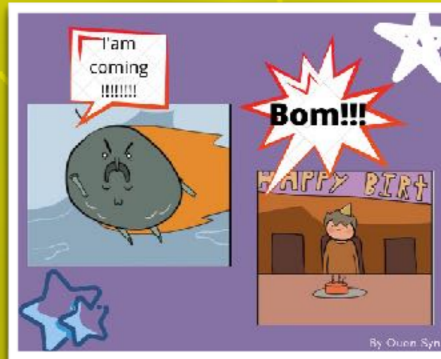
Tan Quen Syn