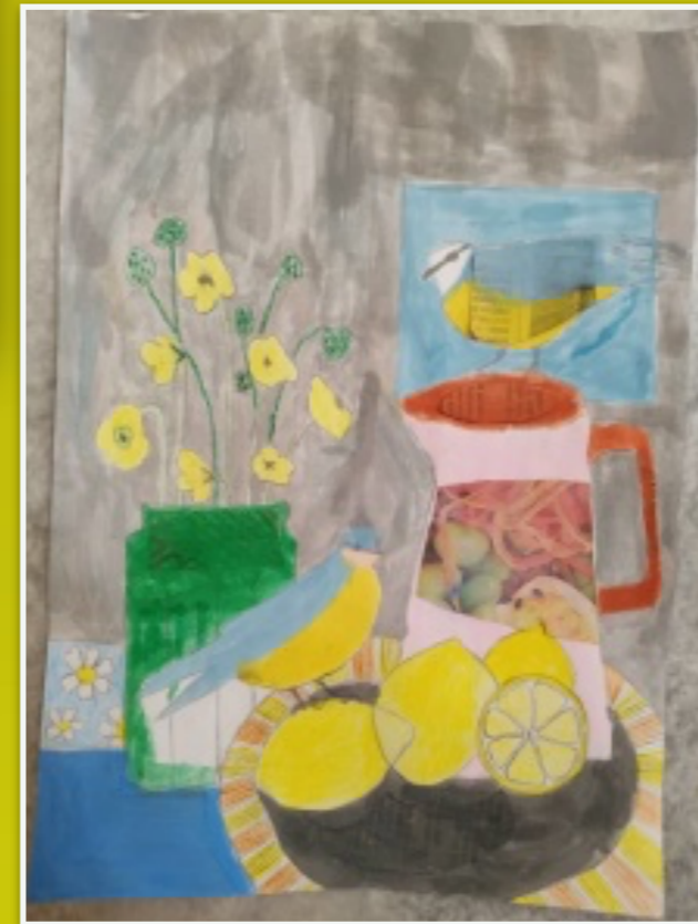
Wong Kin Yui - F2R