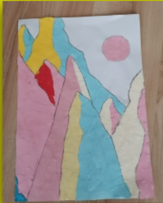
Edreen - F1R