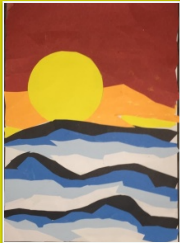
Chong Chee Shuen - F1R