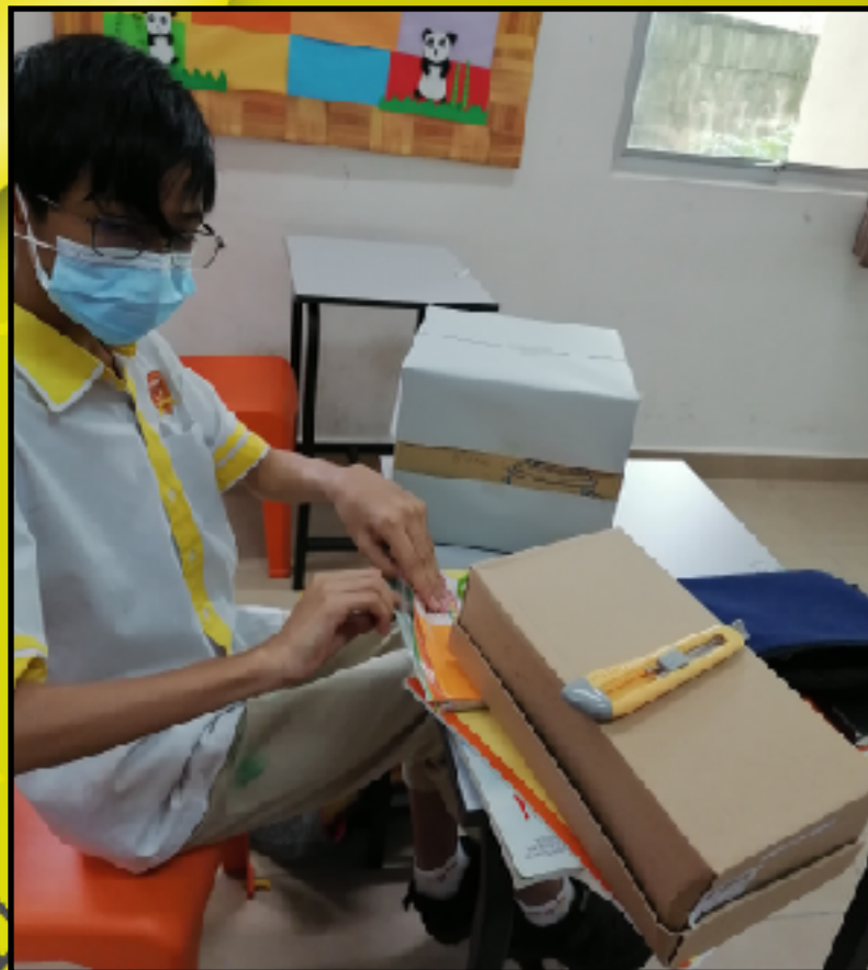
Form 2 students are engaged with their Stem Project - using recycling items..