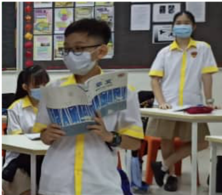
Form 1W students are reading literature exercise