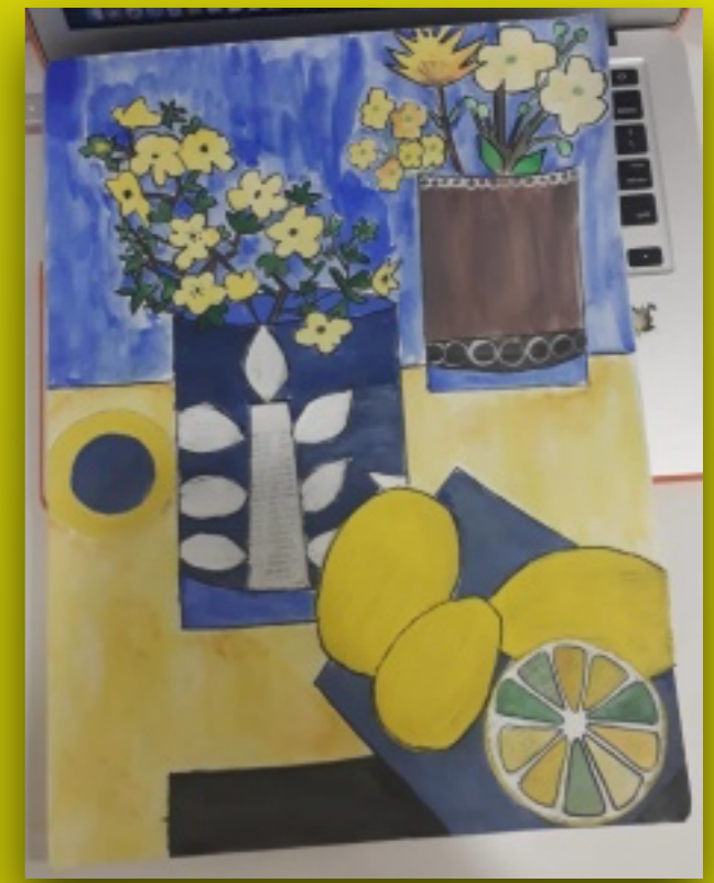
Lim Zhen Ying - F2R