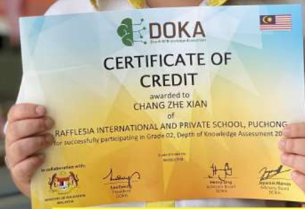
Chang Zhe Xian Standard 2 Respect