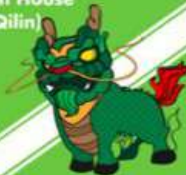
Green House (Qilin)