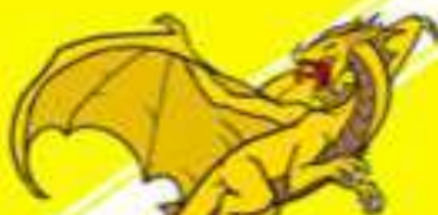
Yellow House (Dragon)