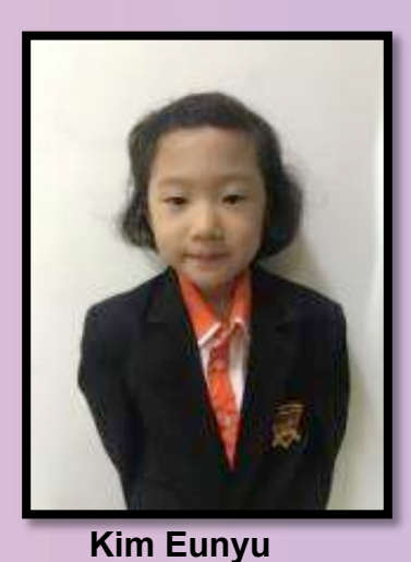
Excellent Academic Performance in: English