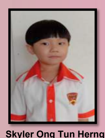
Best Student of the Year Group Excellent Academic Performance in: IPC & Mandarin