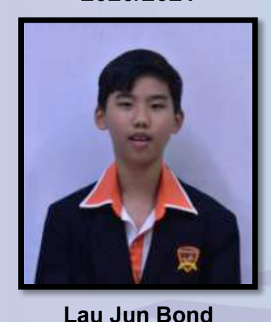
Excellent Academic Performance in : Science & Literature