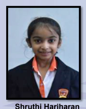
Excellent Academic Performance in :