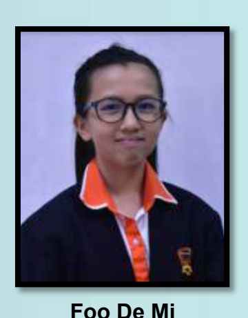
Excellent Academic Performance in : English, GC & Mandarin (Basic)